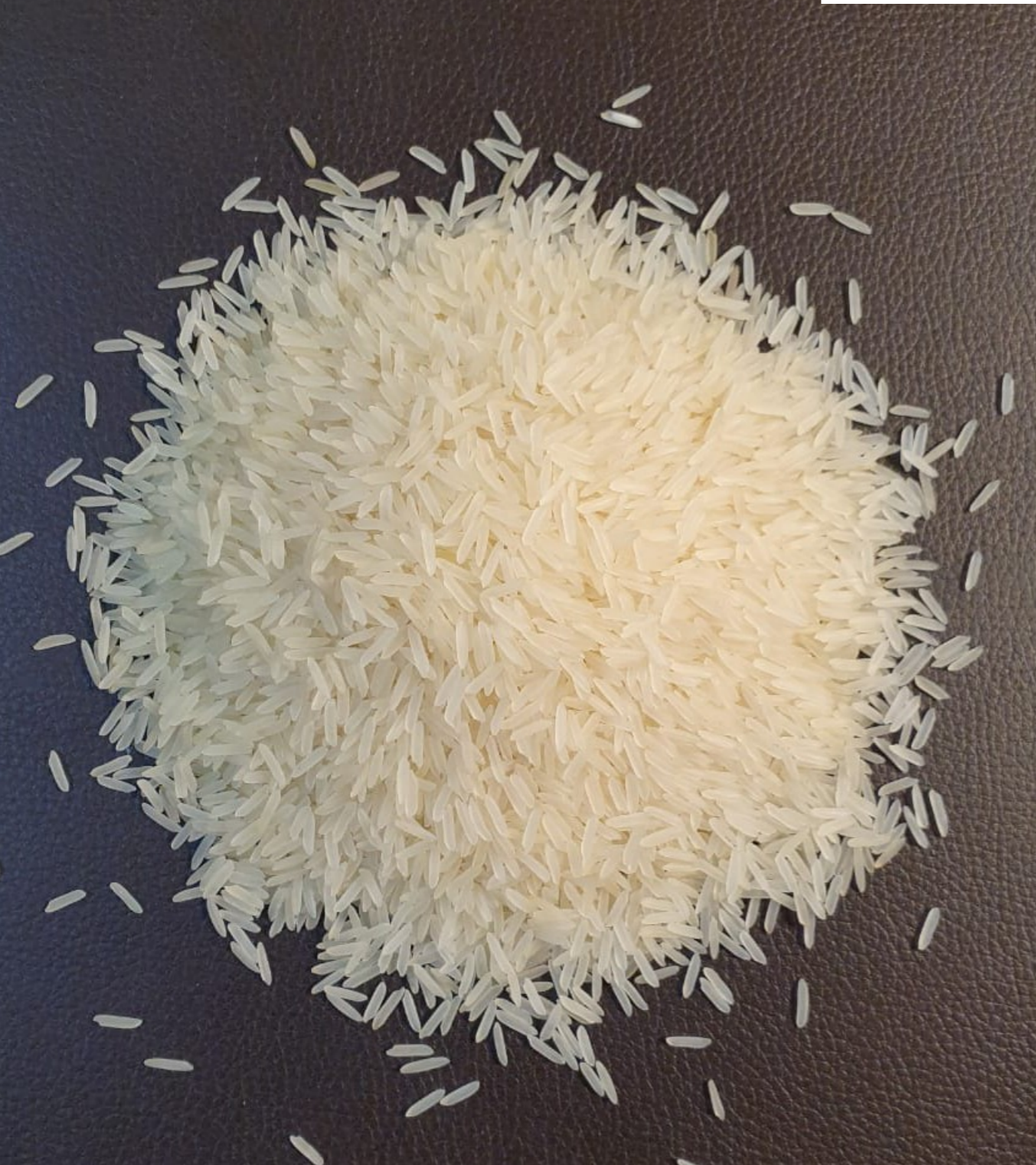
Sugandha White Sella